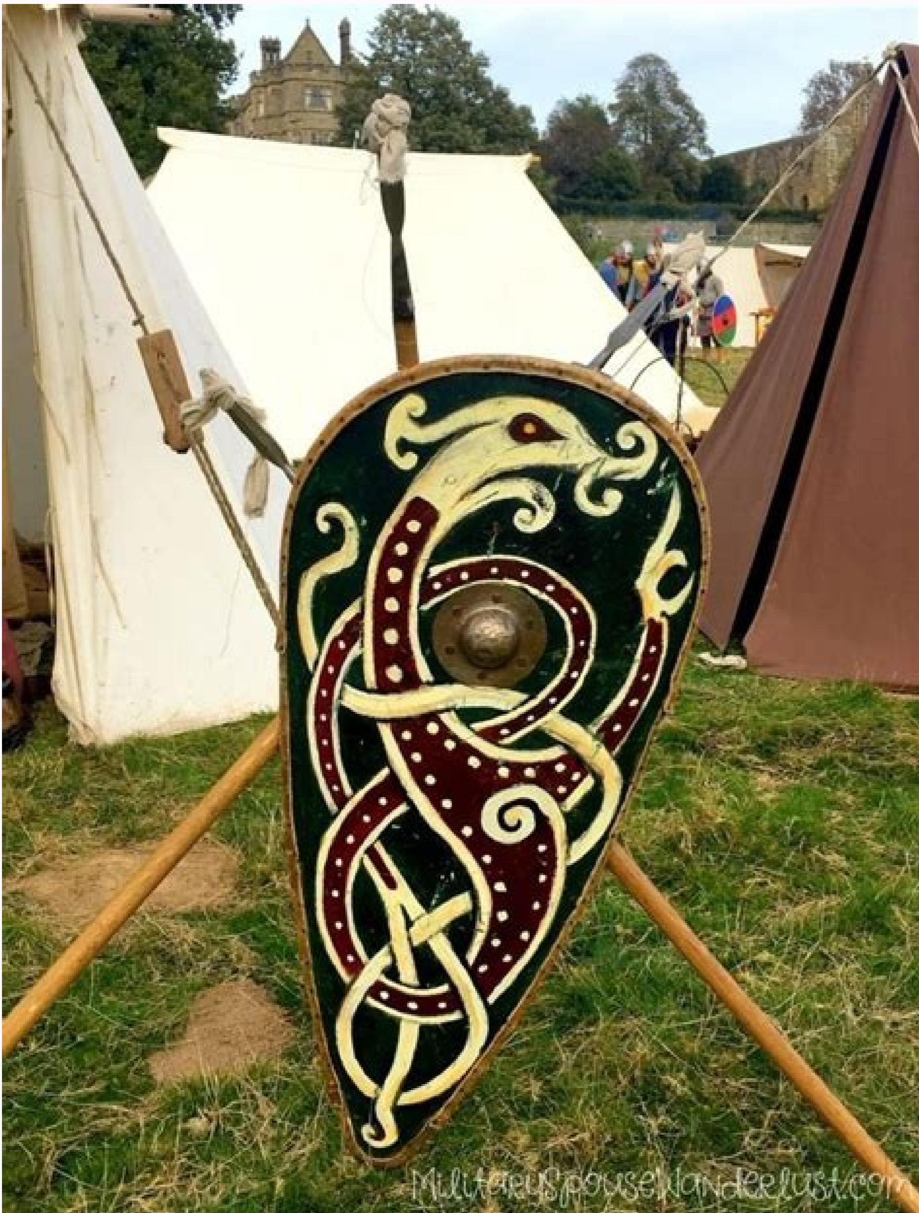
Anglo saxon shield template ks2. Anglo saxon shield design template. Anglo-saxon shield facts.